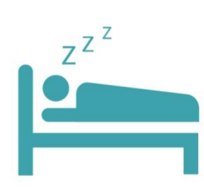
3. Get plenty of sleep.